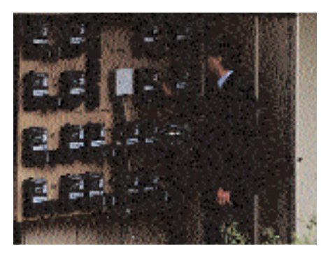
Incoming power revenue metering at the Porter Street Apartment Complex

CALMU meters are economically priced so that, on an installed and amortised basis, they are capable of paying for themselves in terms of potential energy cost savings, within a few months.