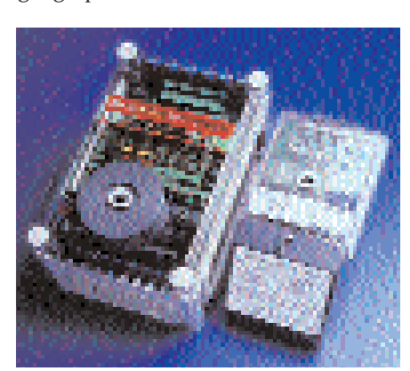
The NC4000 Server (left) and EMS 2600 Meter as used at the Porter Street complex in Prahran, Victoria.

The Nilsen PC-based MeterSoft software interrogates meters for billing purposes as well as providing load control of night-rate hot water heating. In addition, administrative functions including connect and disconnect services can be implemented when required. Error flag detection on individual meters provides tamper alert. Communication with meters is protected by a password thus preventing unauthorised reprogramming or resetting of tariff information. Other features include connect/disconnect, set time. selection of active tariff, configuring of meter parameters, checking meter time and date, etc. MeterSoft is a user-friendly Windows-based software package and with just a single PC, it is possible to access meter networks across large geographical areas.